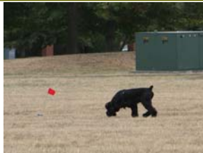
Jett making a bee line for the article