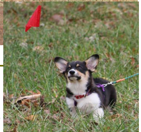
Anyone can track!