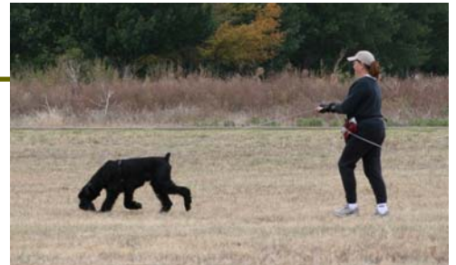
Look ma I'm tracking!

Meeting adjourned at 7:07.p.m. The next meeting will be December 10, 2005 at 5pm at Spring Creek BBQ, I-20 and Wheatland, Duncanville.