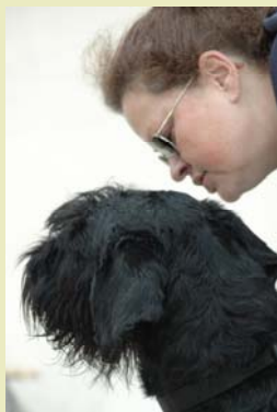
PSST! Classes start soon