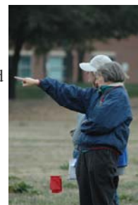
She went that way.