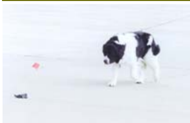
In the right direction

Hello and welcome to the fourth edition of TRACKS.