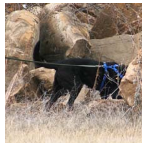
Where are we going next?

As we progress in our quest to form a new tracking club we have launched a club website. One of our members, a closet web designer, has put together a wonderful site. On the site is the current schedule of classes, descriptions of what kind of classes we offer, pictures of the fields we track in, success stories of club members, pictures from the events gone by and links to other areas of interest. You can find it at http://www.dfwtc.org . If you have suggestions or ideas, please email them to crdslabs@yahoo.com .