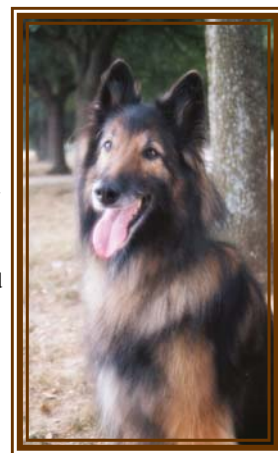
Ambition's Almond Joy Qui Rit

Early in his life we did a little herding, and he showed good aptitude, but I just didn't have the time to track and herd. We haven't gone back to herding and won't unless we can commit serious time to it.