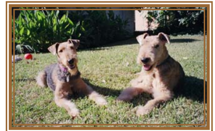
Moxie CDX, RE, AXP, AJP & Tuffy Bear

Substituting some of the wheat flour in most of your dog cookie recipes with tapioca flour will improve the texture, especially for chewy training bait.