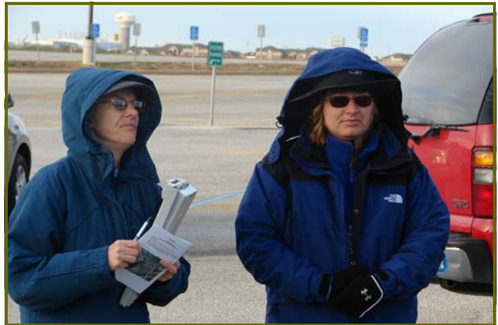
TRACKING JUDGES MUST BE PREPARED FOR ALL WEATHER