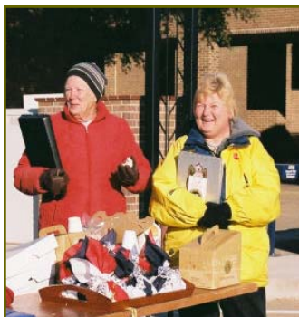
CLUB HOSPITALITY IS A PLUS WHEN JUDGING A TEST

Forward completed application, questionnaire and Part I (open book test consisting of two questions) to the Companion Events Department to begin the approval process. In addition, submit charts for at least two (2) tracks where you served as a tracklayer. After meeting all minimum requirements and receiving a "pass" on the Part I test, the applicant's name will be published on the Secretary's Page of the first available issue of the GAZETTE as an Tracking Judging Applicant.